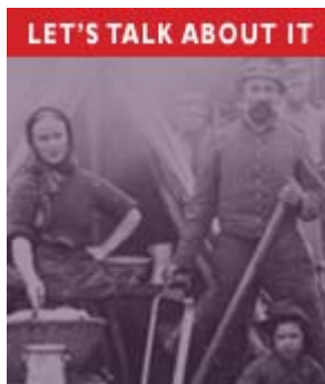
THE CIVIL WAR

Deschutes Public Library wants to hear your family's Civil War story! The American Civil War remains one of the most relevant events in our collective memory. For every American lost or wounded during the war there is a story to be told and a memory to be shared. You are invited to visit the Civil War web site at DPLS and submit your family's Civil War stories by clicking on the Share Your Story link. On the web site, you can explore more about the literary voices, people, places, and leaders of the Civil War, other Civil War resources and the upcoming "Let's Talk About It: Making Sense of the American Civil War" series.